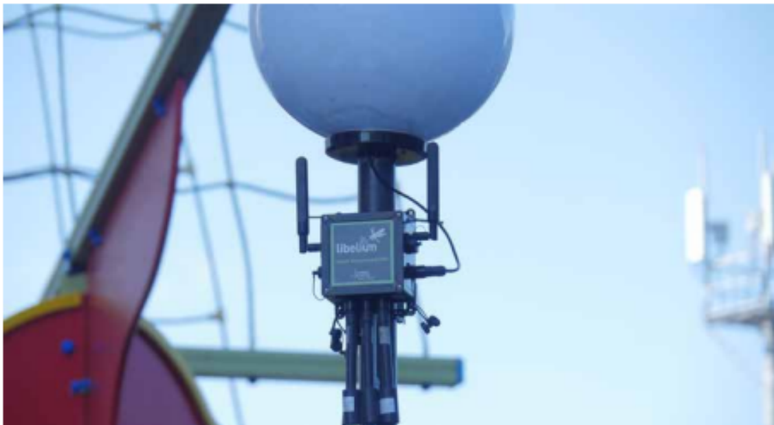
Location of Huesca (Spain)

Asthma is one of the most frequent causes of absenteeism in schools. This disease, that affects the respiratory tract, can alter sleep, play and other activities necessary for proper child growth. In industrialized countries a progressive rise in asthma has been observed. The condition is prevalent between 3 and 30% of school year children aged 6 and 7 years old. The total number of children suffering from this chronic disease increased by 75% between 1980 and 1994. And it is going to get worse because of the increment in emissions.