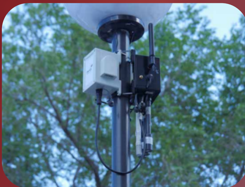
Ease of use, battery life and reliable measurements with Plug&Sense Smart Environment PRO

"Smart Environment PRO is an excellent platform. You can start with the prototype on Wasp mote with Gases PRO in the office and transfer the firmware to a device with a case for outdoor installation. During the day, the battery charge is enough to send measurements via 4G from 5 sensors once a minute or more. During the night time, the battery is recharged from the lanterns, where the sensor is installed. It is compact and flexibly programmable with a high frequency of measurement acquisition. Moreover, it has more reliable measurements (due to factory calibration) than alternative Arduino-compatible solutions, and also it provides an opportunity to get the system ready for operation fast", said Airalab team.