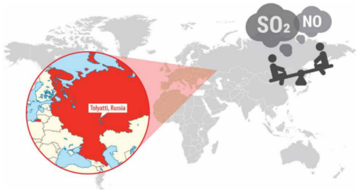
Location of Togliatti (Russia)

This project features a system of sensors that monitor air quality in the yard. Airlab uses blockchain technology for storing information in a decentralized network. In this case, it allows the state and its citizens to obtain trusted data and use it along with the information from stationary posts.